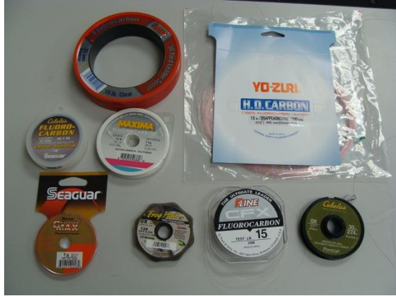
Figure 1: The eight brands and types of line tested in the experiment.