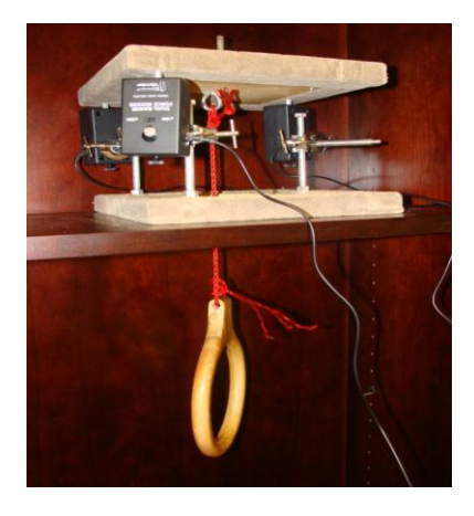
Figure 2: Force plate used for measuring force in newtons of breaking strength of fishing line. Another handle is added below the handle pictured and is pulled to exert force on the line.

Fluorocarbon leader materials were tested using a force plate with a circular wooden handle on each end of the line. The leader was wrapped around the lower part of the handle connected to the force plate and then wrapped around the top part of the second circular handle which then hangs below. Transparent tape was then used to secure the leader to the handle. After placing the line for the test, the computer is then activated with the data collection software program, Logger Pro, which is used to calculate the force in newton's versus time in seconds. The control of the experiment was that the same individual exerted the force on the lowest handle, pulling the line until its breaking point and that same individual tied the knot. Each line type was tested with five trials with a Uni Knot and five trials without a knot. Results from each trial were entered into Microsoft Excel and the force was converted from newtons to pounds. Results from all five trials were then averaged to compute the average breaking strength of each line type. The uncertainty, percent of rating, and tensile strength for each leader was also computed.