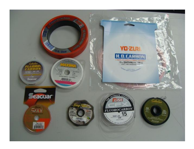
Figure 1: The eight brands and types of line tested in the experiment.